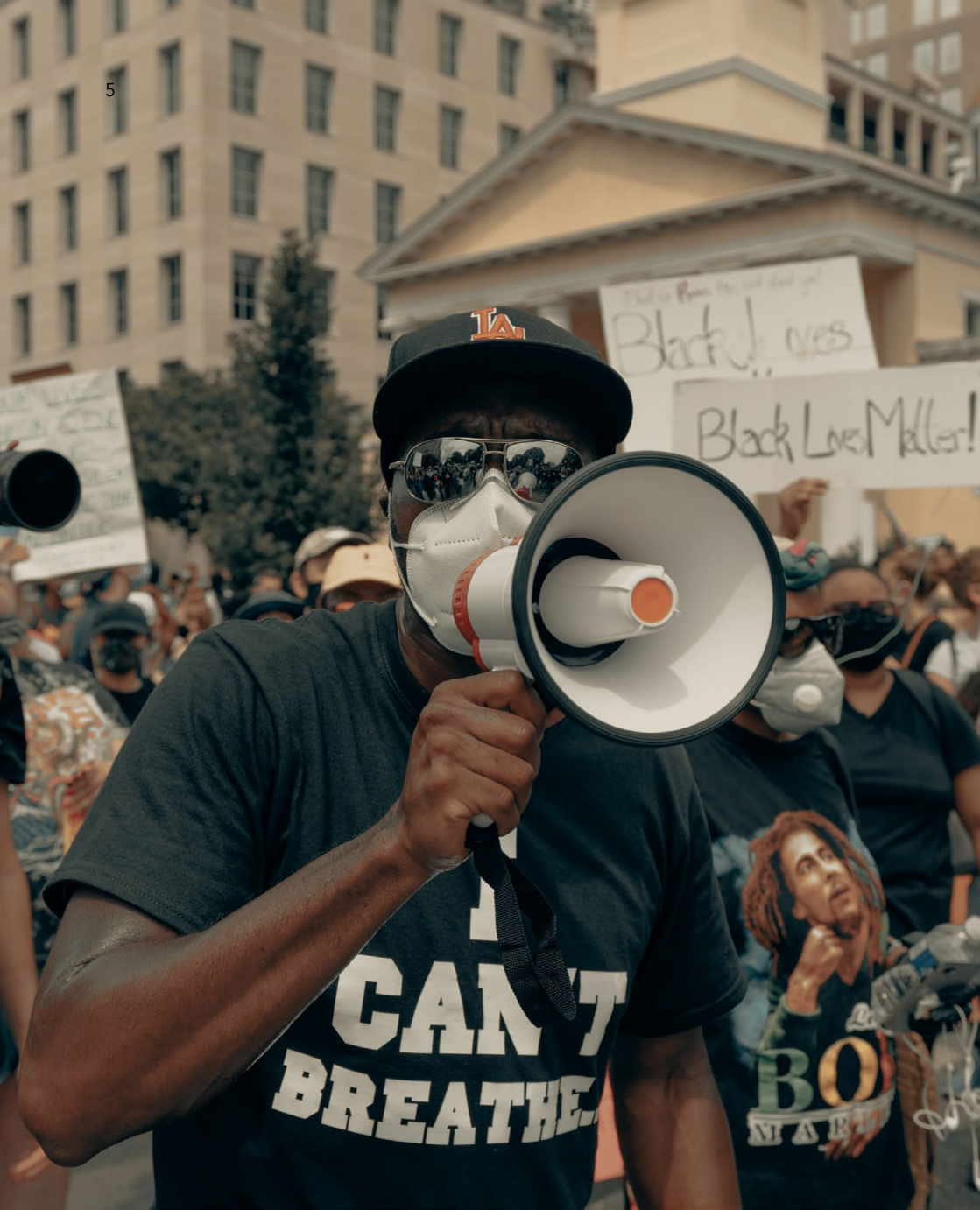
A man holds a megaphone at the Black Lives Matter protest in Washington DC 6/6/2020