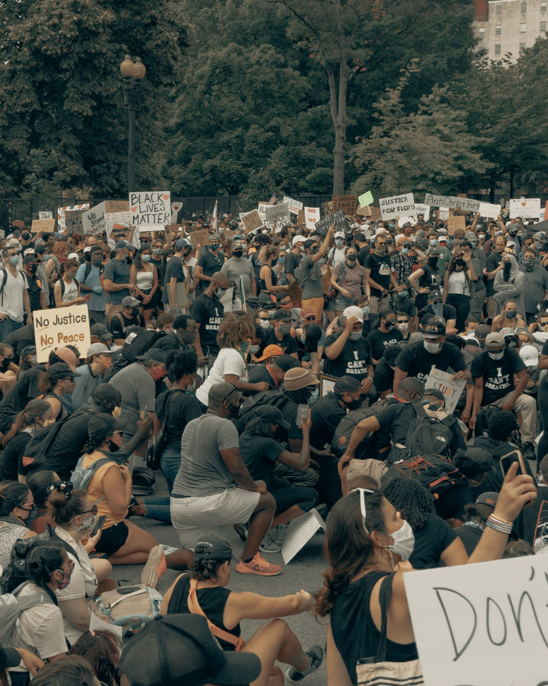
The crowd kneels at the Black Lives Matter protest in Washington DC 6/6/2020